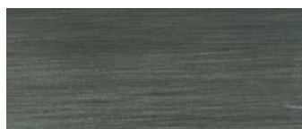
metallo brunito spazzolato a mano hand-finished burnished metal