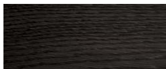
rovere spazzolato Liquorice Liquorice brushed oak