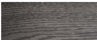
rovere spazzolato Charcoal Charcoal brushed oak